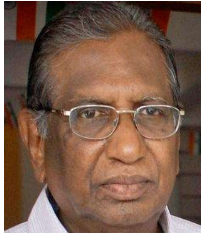
Prof. Kothapally JAYASHANKAR, The ideologue of Telangana, Indian Academic & Social Activist (1934-2011)